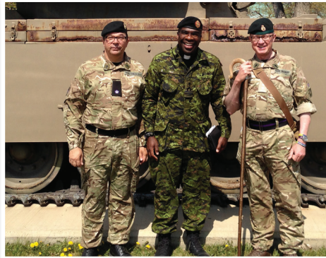
Chaplain in mission