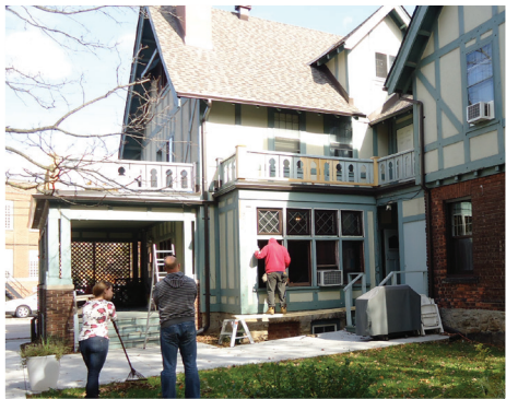
"Window on Injustice": Concrete symbols of partnership between community partners and women reintegrating into society in Dundas, Ont.