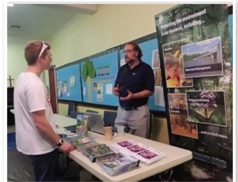
Advocating for ecojustice in Winona, Ont.

THE ANGLICAN CHURCH OF CANADA, 80 Hayden Street, Toronto, ON M4Y 3G2 416-924-9192 or toll-free 1-866-924-9192 • www.anglican.ca • www.niagaraanglican.ca